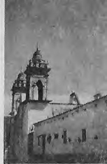
The church of San Francisco Chilapa, Guerrero

Certainly, since I met His Excellency the Bishop in Rome in 1968 and placed myself and my little community of Minims into his hands, how often I have pleaded with His Excellency to deign to take care of the Work in its masculine branch. How I have